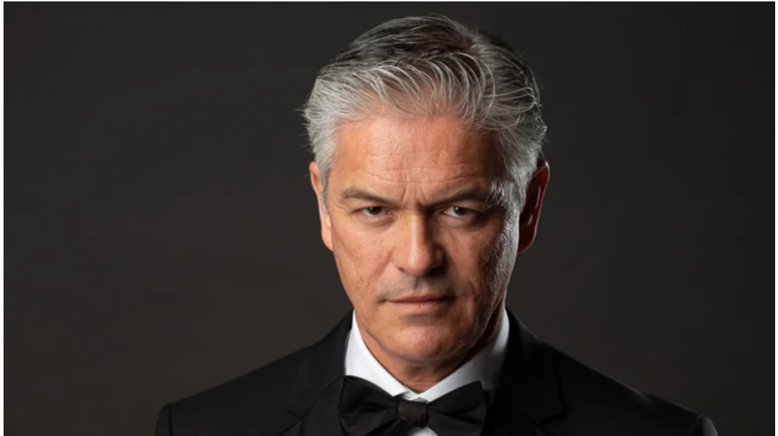
Alejandro de Hoyos