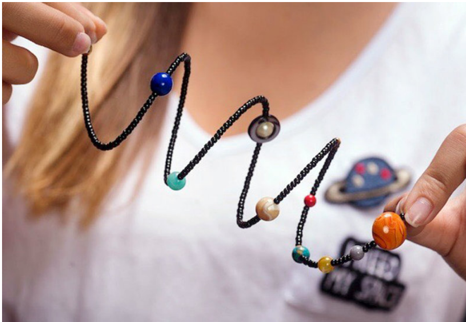
The Astronobeads bracelet.